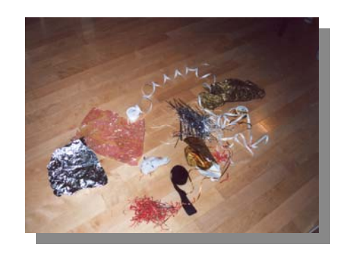
Sample materials for Comet on a Stick